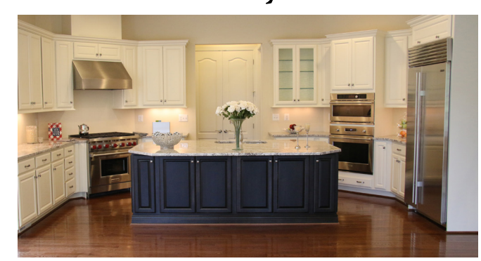
The Yarborough, Lot 18 $1,699,000 1379 Blairstone Dr.