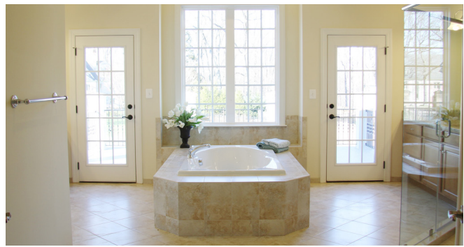
The Yarborough, Lot 19 $1,669,000 1381 Blairstone Dr.