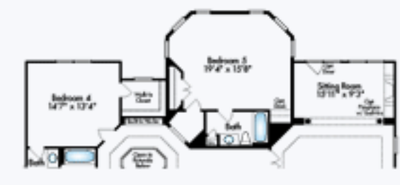
Portial Upper Level Plan With Optional Bedroom 5 With Optional Rear Family Room Extension